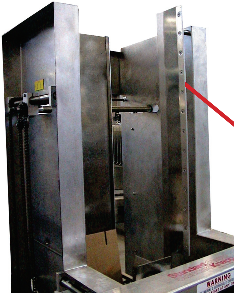
Figure 1.1 - Spring Metal Tray Blank Retainer