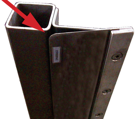
Figure 1.2 - Close-up View of Tray Blank Retainer

Call the Standard-Knapp Sales Department at 1-800-628-9565 for ordering information.